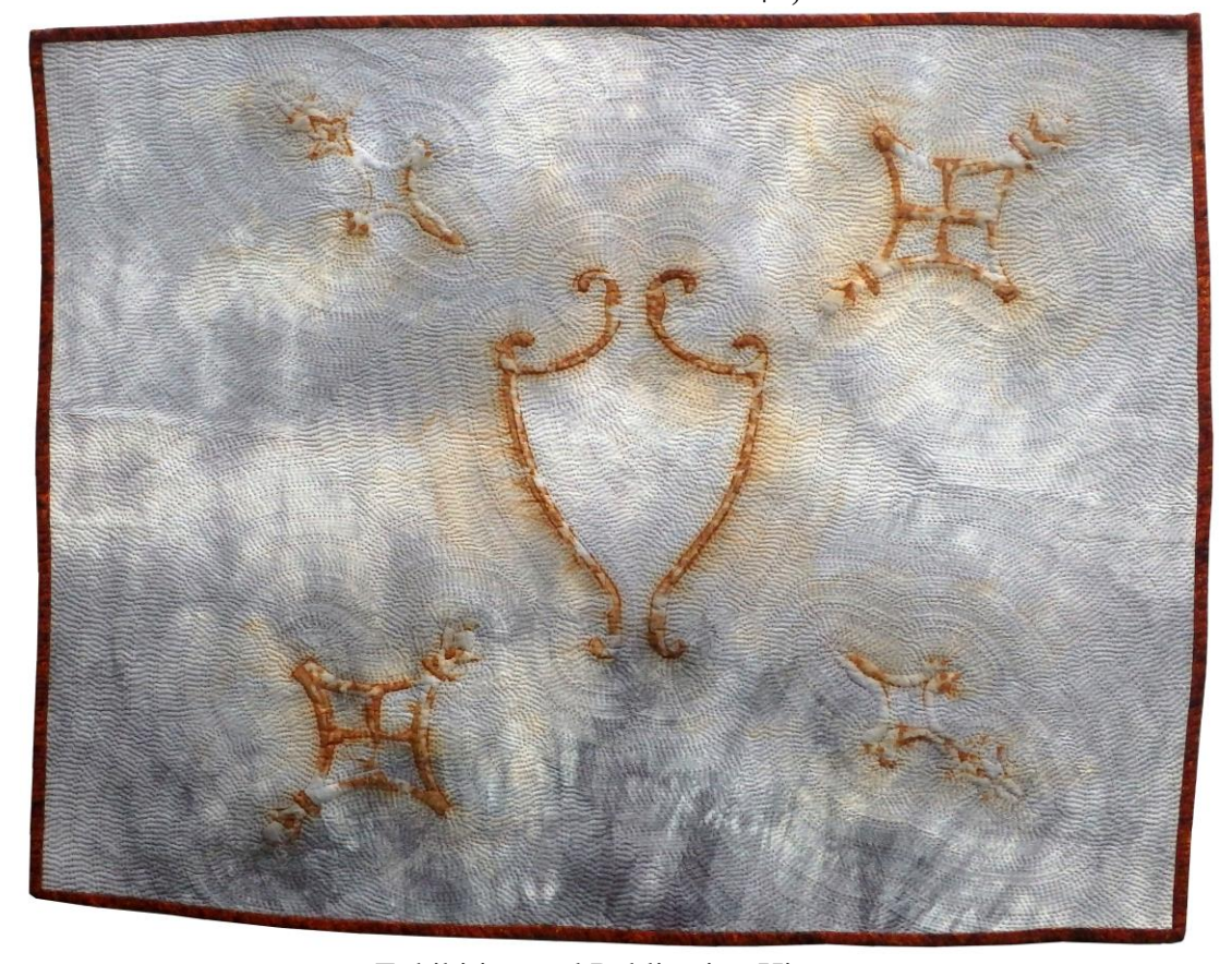
Exhibition and Publication History

© 2011-2022 Jean M. Judd, Textile Artist/Artists Rights Society (ARS) New York Hand Stitched Thread on Hand Dyed Rust Pigmented Textile **Available for Purchase - $7,700**